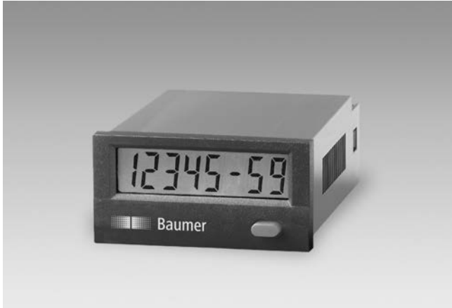
ISI34 - Hour counter